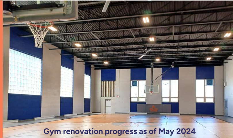
Gym renovation progress as of May 2024